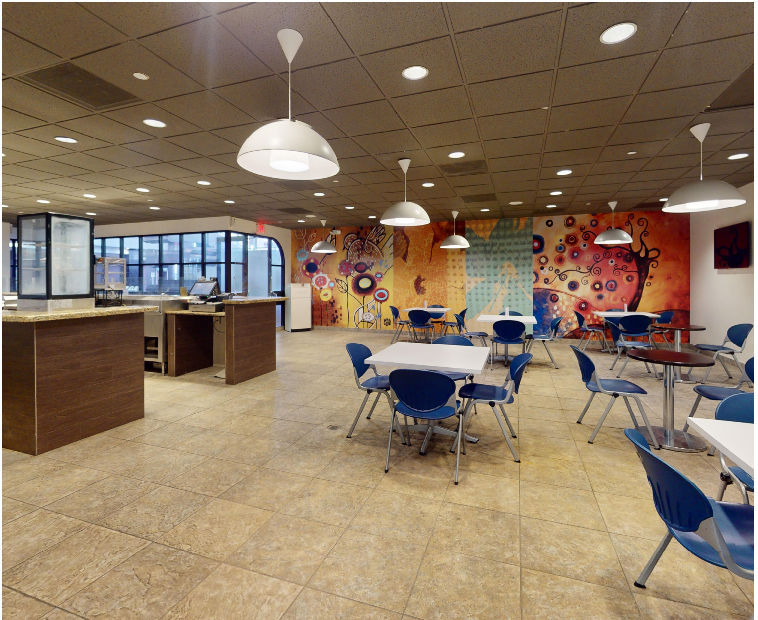
SUBLEASE OFFICE SPACE IN THE MIAMI MARRIOTT DADELAND HOTEL