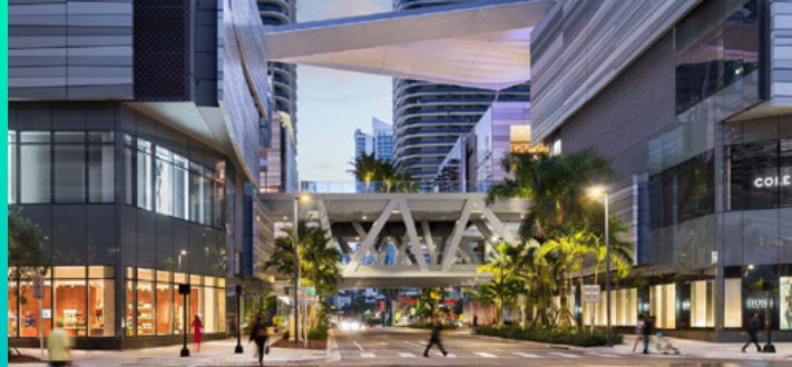
Left Brickell - 8 miles 🚗 28 MIN DRIVE