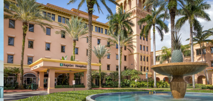
Left Baptist Health Hospital - 0.3 miles