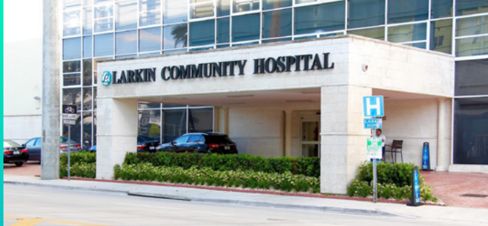
Above Larkin Community Hospital - 1.2 miles