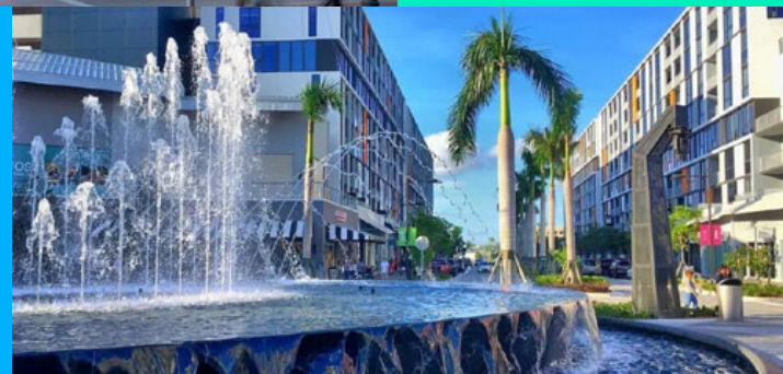
Left Coconut Grove - 4.7 miles 🚗 17 MIN DRIVE